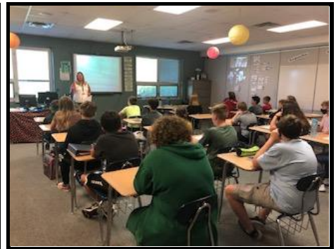
Williamston Middle School faculty, staff, and students on the first day back to school.